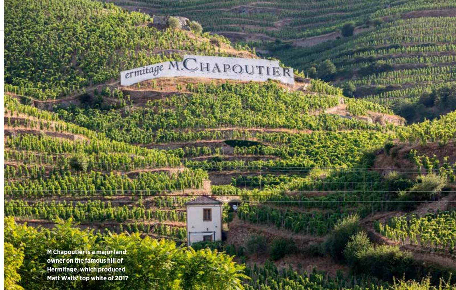
M Chapoutier is a major land owner on the famous hill of Hermitage, which produced Matt Walls' top white of 2017

This lieu-dit wine includes some fruit from pre-phylloxera vines planted in 1860 on 'granilite' soils – granite with a touch of