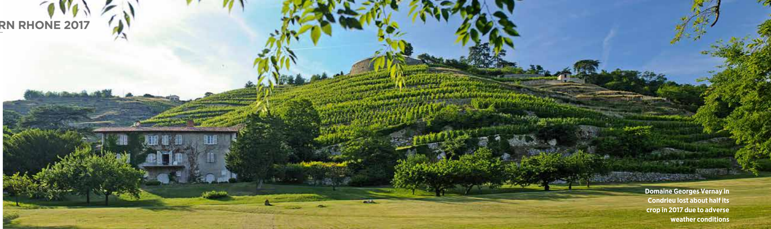
Domaine Georges Vernay in Condrieu lost about half its crop in 2017 due to adverse weather conditions